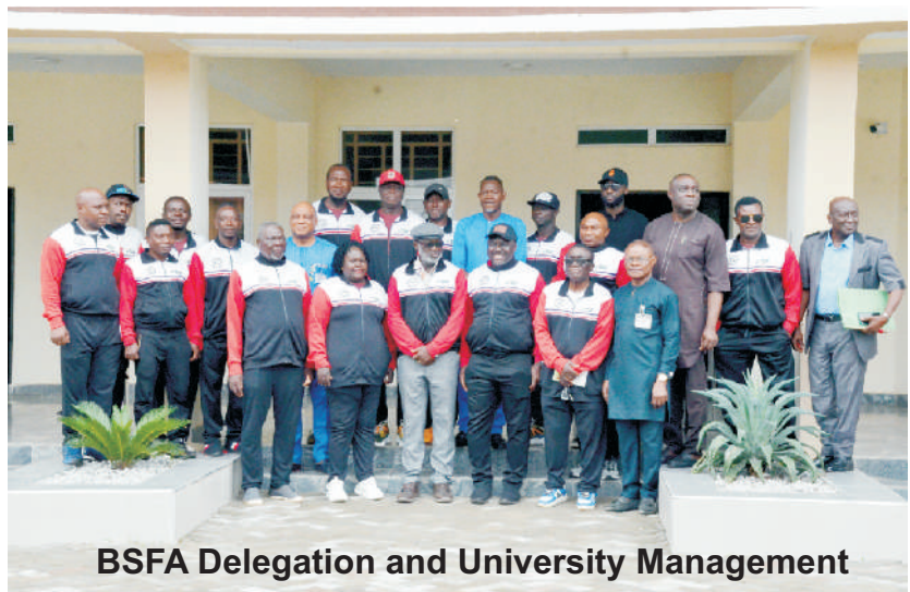
BSFA Delegation and University Management