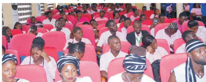
Students of Theatre Arts Department, BSU