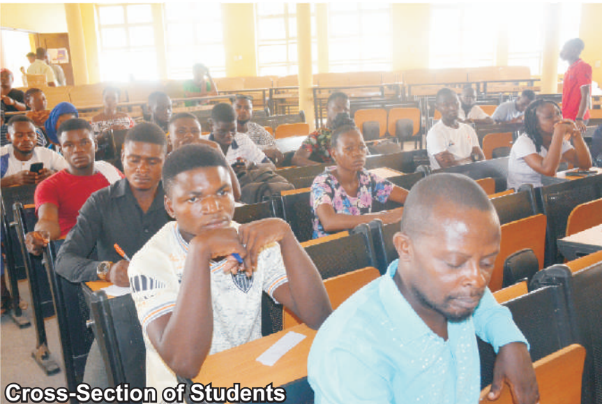
Cross-Section of Students