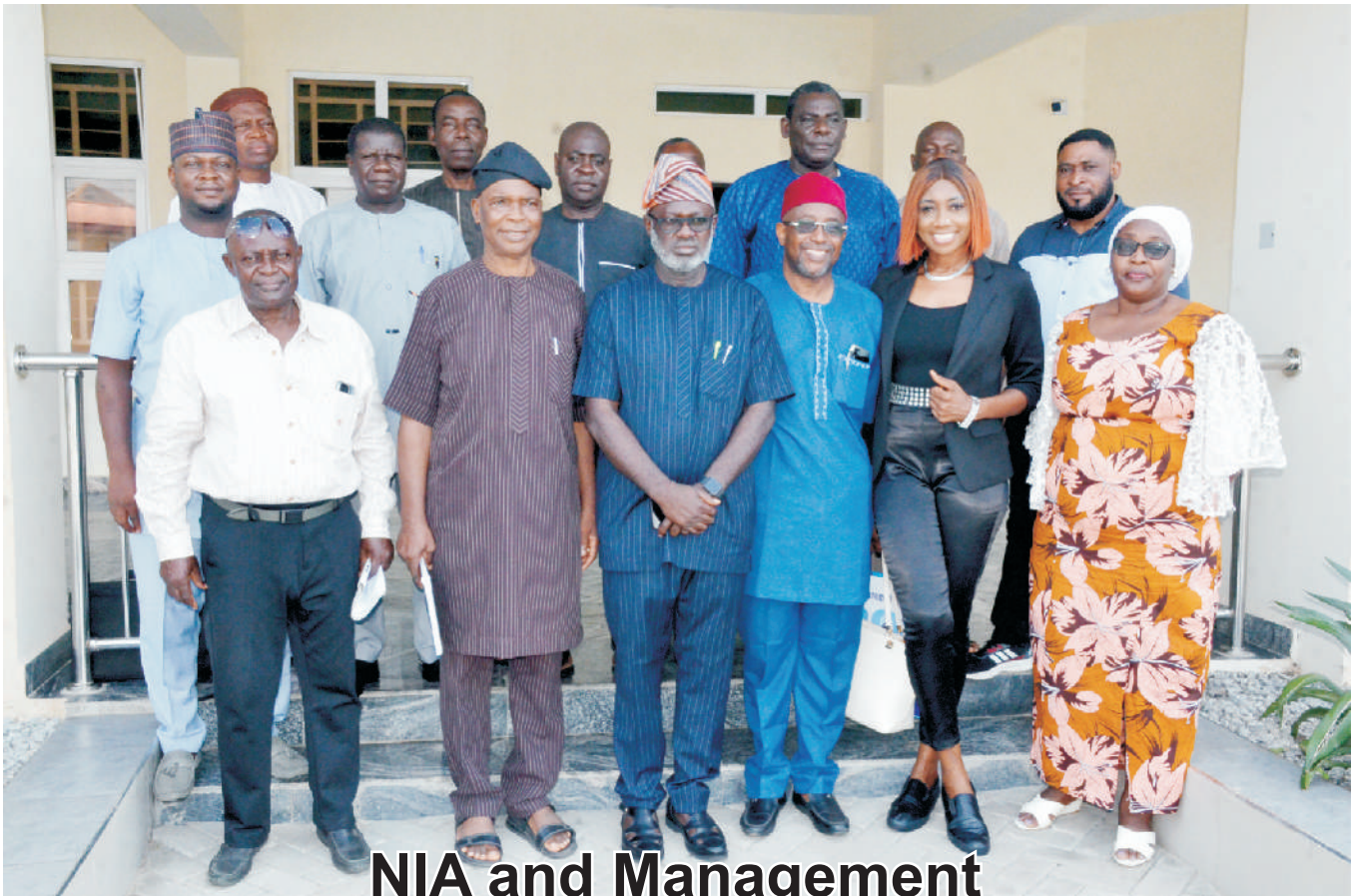
NIA and Management