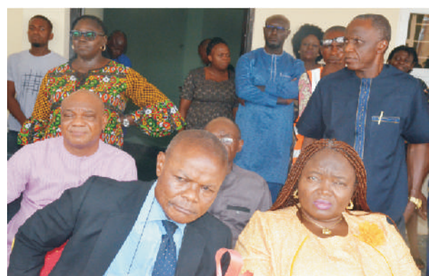
Cross-Section of Management