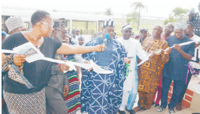
Sen. Akume commissions the Faculty of Science Complex