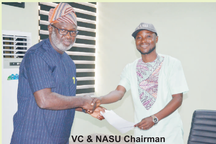
VC & NASU Chairman