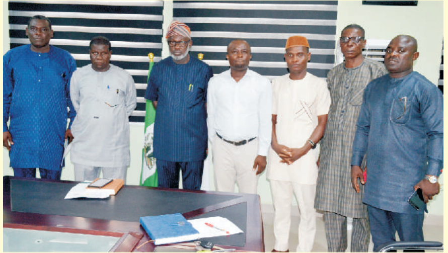
Exco with the VC