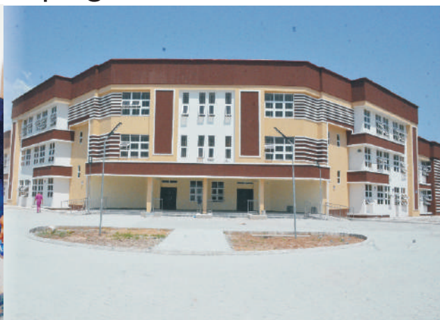
Sen. Akume Commissioning the Administrative Building