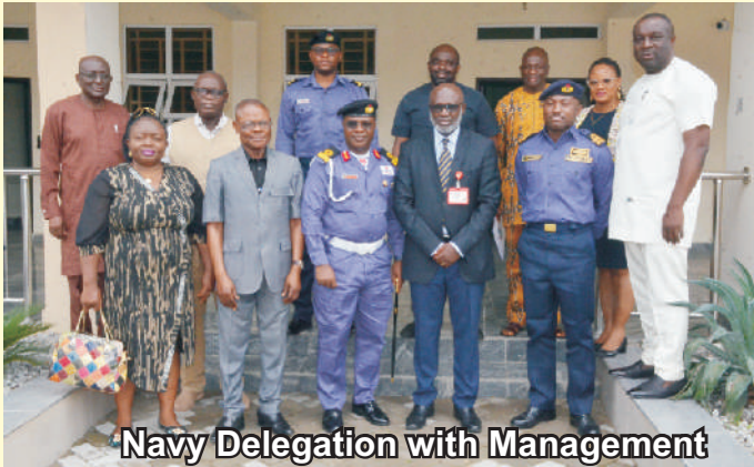
Navy Delegation with Management