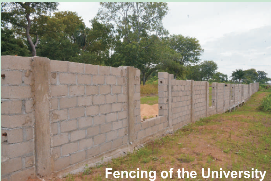
Fencing of the University

The total sum of the proposal aims to develop the centre to a mutually beneficial partnership with our commitment to convene the necessary local and international expertise and to source for the funding to support the research and training costs at the centre. With the understanding that the University will support this partnership by certifying graduates from the programme, providing suitable facilities including office spaces, lecture rooms and full access/management of the BSU Zoological Garden.